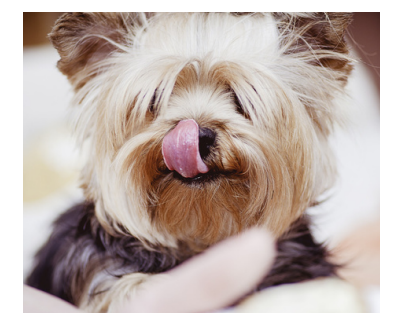
Tongue flicks can indicate discomfort when it's not associated with eating and drinking.