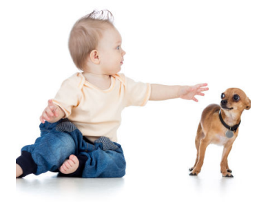
Ears back, tight jaw, paw lifted and tail down are all signs of a fearful dog.