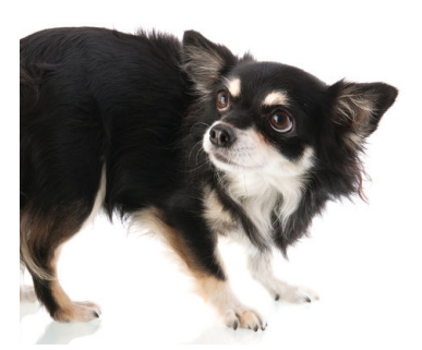
The term "whale eye" is often used when the whites around the eyes are visible. It's a clear sign of stress. This dog is also cowering, asking for space.