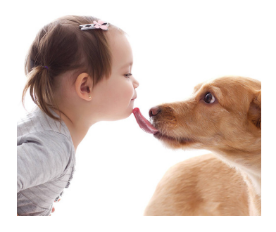
Not all licking is "kissing." This dog is asking for space. If the licking feels frantic, remove your child in a timely manner.