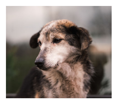
Dogs who turn away are often trying to appease you or another threat. They are trying to say they mean no harm. Back away.