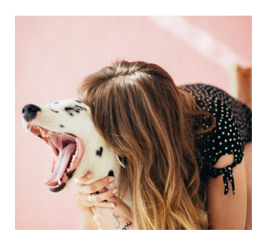
Dogs often yawn at times of stress. Look at the context – are they being restrained? Is there a crying baby nearby or a new piece of baby equipment?

Many parents say it was a total surprise when their dog lunged at their child. But truth be told, dogs communicate in "whispers" before they begin to "shout." By understanding your dog's stress signals, you can intervene before the dog escalates to a growl, lunge or bite.